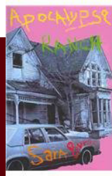
Apocalypse Ranch Sara Burge